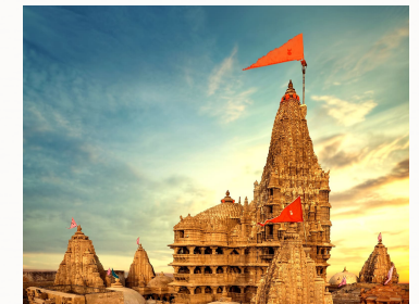
Dwarkadhish Temple, Gujarat

TOTAL COST - RS. 45,000 PER PERSON (INCLUDING AIRFARE + ACCOMMODATION (EXCLUDING TAXES AND MISCELLANEOUS CHARGES)