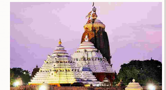
Jagannath Temple, Odisha